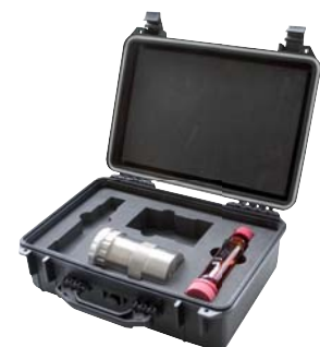
Filterholder carrying case