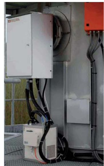
Sampling Unit installation